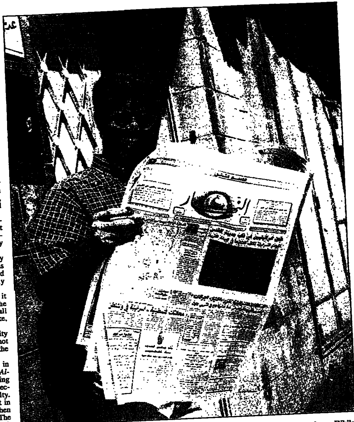
As the year began, the eastern Jerusalem daily newspaper An-Nahar printed its last issue. While many papers have died, this passing is rich with political implications.

Today there are new newspapers in the Palestinian Authority, Al-Hayat Al-Jedidah ("New Life") and Al-Ayam , reportedly